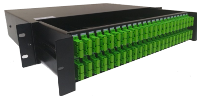
IFRMPP48SCD Fiber Patch Panel, 48 Ports SC Duplex