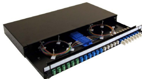
IFRMPP24SCS Fiber Patch Panel with 24 Ports SC Simplex