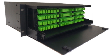
IFRMPP144SCS Fiber Patch Panel, 144 Ports SC Simplex