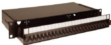
IFRMPP24STS Fiber Patch Panel with 24 Ports ST/FC