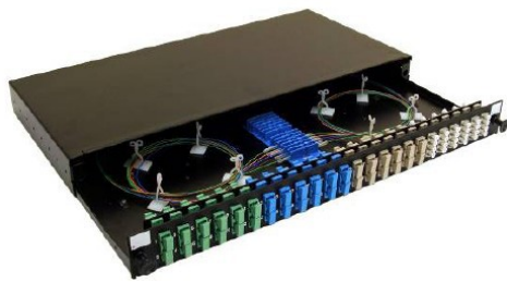
IFRMPP24SCD Fiber Patch Panel with 24 Port SC Duplex