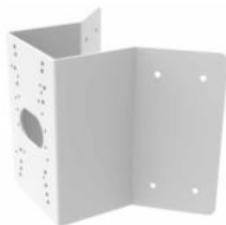
Corner Bracket IBCRWM