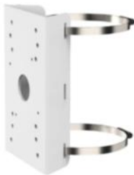
Pole Bracket IBBCPM