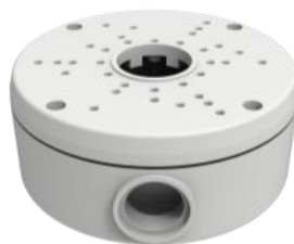
Junction Box IBBWM-134