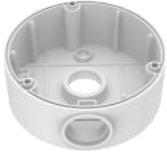
Junction Box IJDWM-115