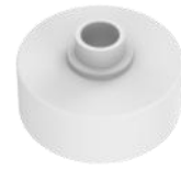
Junction Box IJBBCM-115