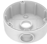
Junction Box IJDWM-115