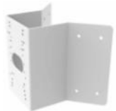
Corner Bracket IBCRWM